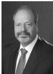
Oscar Leeser Mayor, City of El Paso