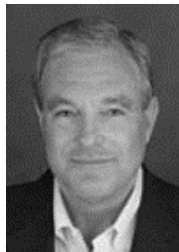
Dee Margo Mayor, City of El Paso