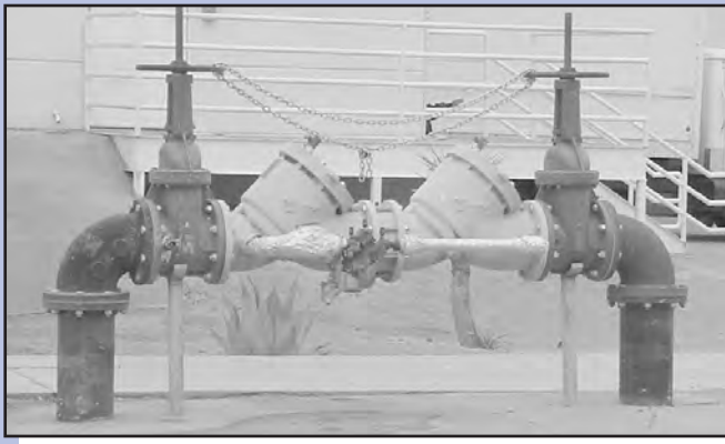
Sample of a large backflow unit.

types of BPA devices, depending on the assessed hazard and type of installation: Air Gap; Reduced Pressure Principle Assembly; Reduced Pressure Principle Detector Assembly; Double Check Assembly; Pressure Vacuum Breaker. The installation of a BPA device must be performed by a licensed plumber.